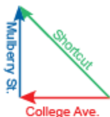
Figure 3. Walking a block on College Avenue and Mulberry Street--or taking a shortcut.

When you walk in a city, you usually stick to sidewalks, so you might walk a block and then turn a corner and walk another block. If the buildings were to disappear, you could instead cut across the empty lot. Either way, you'd end up on a street corner diagonally across the block from where you started. You could show that as two vectors adding to make a third. (Fig. 3.)